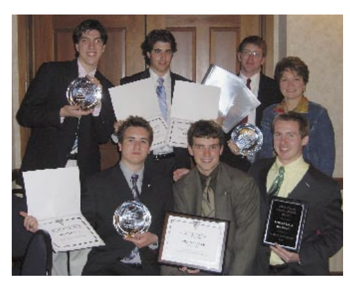
The members of the spring 2008 pledge class, who were initiated on March 30.

We will be applying for our charter at the 169th General Convention this summer in Dallas, Texas. The General Convention will be