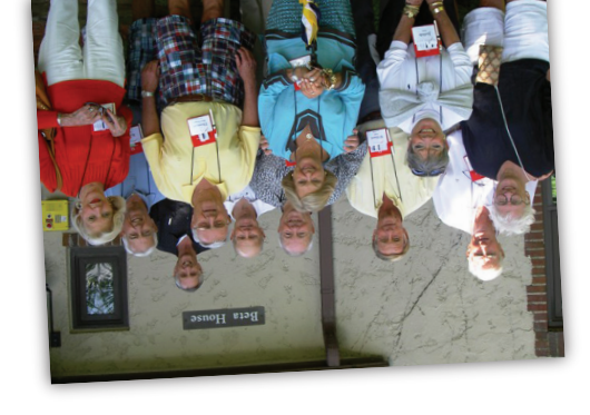
to find out who they are. than 50 years after they first met! See inside