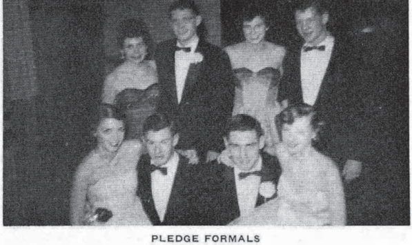
Find more pictures from the scrapbook in the Archives Album at www.betadenison.com.

with two breathers over the Lambda Chi's and the DU's teams, Beta ended n a first place tie with the Phi Gams which is a considerable improvement over last year's third place standing.