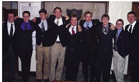
The Epsilon pledge class after their pledge ceremony.

This year at the Alpha Eta Colony of Beta Theta Pi, we say goodbye to the last of the re-founding fathers and turn to the new generation of Betas. With a stellar recruitment year of 15 new brothers, this generation looks hopeful. The colony looks to continue the success next year and start the process of receiving the charter in the summer of 2008. The colony achieved a grade point average of 3.21 and continues to strive for excellence in that field. The newest spring pledge class took the lead in community service with their pledge class project. They organized and ran a campus-wide collection of donations for the local Salvation Army, as well as committed themselves on the weekends to serve the needs of others.