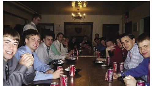
A whole colony dinner to celebrate the new pledges and enjoy some good food.