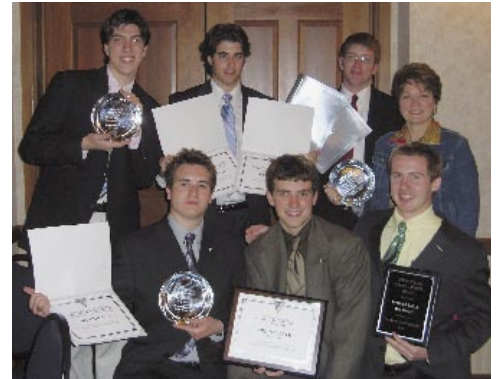
The members of the spring 2008 pledge class, who were initiated on March 30.

Recently, we participated in Relay for Life, in which our 15-man team raised a total of $600. Our future philanthropy plans include a program called Kats With Bats, which is a Kappa Alpha Theta fundraiser involving competing wiffle ball teams.