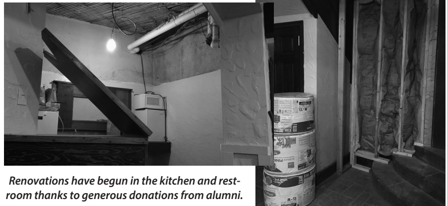
Renovations have begun in the kitchen and restroom thanks to generous donations from alumni.

Thanks to gifts from our alumni, we have been able to transform the old bar area into a kitchenette complete with appliances. This is now a space where actives can prepare after-hours meals and snacks and is a great addition to the house in our attempt to remain a competitive house option at Denison.